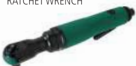
JAR-1124 1/2" RATCHET WRENCH

Bolt Capacity : 12 mm Max. Torque : 136 Nm Free Speed : 300 RPM Air Consumption : 5.5 cfm Weight : 1.52 kg