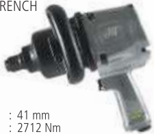
IW-8305HP-HK 1" IMPACT WRENCH 2" ANVIL

Bolt Capacity : 41 mm Max. Torque : 2712 Nm Free Speed : 3,500 RPM Air Consumption : 11 cfm Weight : 9.6 kg