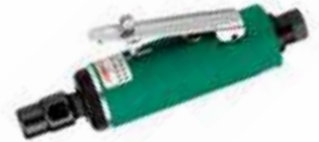
JAG-0903-FM 6mm HEAVY DUTY GRINDER

Collet Size : 6.0 mm Free Speed : 25,000 RPM Air Consumption : 3 cfm Weight : 0.3 kg