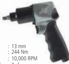
IW-3200HP 3/8" IMPACT WRENCH

Bolt Capacity : 13 mm Max. Torque : 244 Nm Free Speed : 10,000 RPM Air Consumption : 3 cfm Weight : 1.3 kg