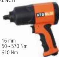
RP-7451 (Twin Hammer) 1/2" IMPACT WRENCH

Bolt Capacity : 16 mm Working Torque : 50 - 570 Nm Max. Torque : 610 Nm Free Speed : 7,500 RPM Air Consumption : 6.5 cfm Weight : 2.10 kg