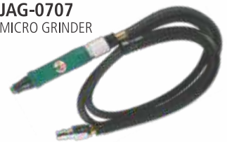
JAG-0707 MICRO GRINDER

Collet Size : 3, 1/8, 3/32 inches Free Speed : 60,000 RPM Air Consumption : 2.8 cfm Weight : 0.13 kg