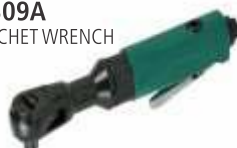
JAR-6309A 1/2" RATCHET WRENCH

Bolt Capacity : 10 mm Working Torque : 85 Nm Max. Torque : 100 Nm Free Speed : 170 RPM Air Consumption : 4 cfm Weight : 1.4 kg