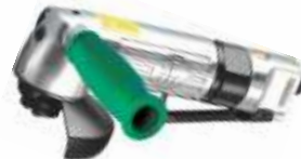
JAG-6638 HEAVY DUTY ANGLE GRINDER

Disc Capacity : 125 mm Free Speed : 11,000 RPM Air Consumption : 6 cfm Weight : 1.8 kg