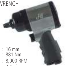
IW-4326HP 5/8" IMPACT WRENCH

Bolt Capacity : 16 mm Max. Torque : 881 Nm Free Speed : 8,000 RPM Air Consumption : 4.5 cfm Weight : 2.1 kg