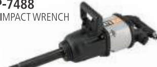
RP-7488 1" IMPACT WRENCH

Bolt Capacity : 50 mm Working Torque : 280 - 2,200 Nm Max. Torque : 3,000 Nm Free Speed : 3,600 RPM Air Consumption : 40 cfm Weight : 16.3 kg