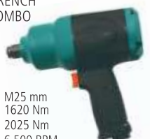
JAI-0936 3/4" IMPACT WRENCH HEAVY DUTY COMBO

Bolt Capacity : M25 mm Working Torque : 1620 Nm Max. Torque : 2025 Nm Free Speed : 6,500 RPM Air Consumption : 6.7 cfm Weight : 3.89 kg