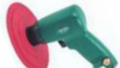
JAS-6633F AIR SANDER

Pad Size : 1/2" to 5" Free Speed : 18,000 RPM Air Consumption : 4 cfm Weight : 1.2 kg Optional : Protection Cover