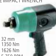
JAI-0926 3/4" COMPOSITE IMPACT WRENCH

Bolt Capacity : 32 mm Working Torque : 1350 Nm Max. Torque : 1626 Nm Free Speed : 5,750 RPM Air Consumption : 6.9 cfm Weight : 3.15 kg