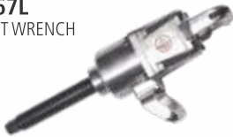
JAI-6267L 1" IMPACT WRENCH

Bolt Capacity : 38 mm Working Torque : 280-1500 Nm Max. Torque : 2439 Nm Free Speed : 2200 RPM Weight : 12.2 kg