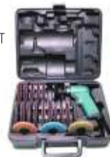
JAS-0433K 3" AIR SURFACE PREPARATION TOOL KIT

Pad Size : 3" Free Speed : 16,000 RPM Air Consumption : 3.5 cfm Weight : 0.7 kg