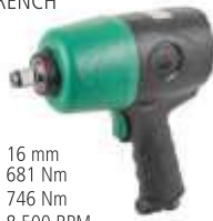
JAI-0924 1/2" IMPACT WRENCH

Bolt Capacity : 16 mm Working Torque : 681 Nm Max. Torque : 746 Nm Free Speed : 8,500 RPM Air Consumption : 4.7 cfm Weight : 1.94 kg