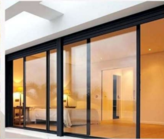
GLASS DOORS & HANDLES