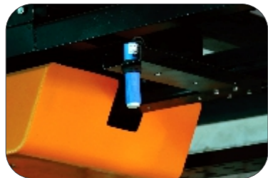
Ultrasonic sensors for Automatic vehicle length sensing

With STORM, ATS ELGI brings a simple and pragmatic approach to car washing. STORM gives a quick and brisk wash in less than 3 minutes. The ultrasonic sensors, the corrosion resistant design, the torque limiter, the foam stoppers and the integrated under chassis washer makes STORM the product to reckon with.