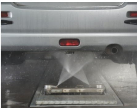
with integrated UNDER CHASSIS WASHER (Optional)